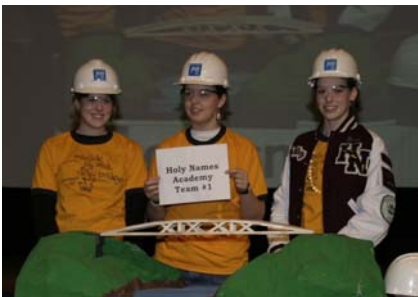
2007 PSB Overall Winner: Holy Names Academy

On February 23 rd , the Seattle YMF held their 12 th annual Popsicle Stick Bridge Contest. This year's event was held at the Museum of Flight in Seattle and featured over 20 teams from Western Washington high schools. The competition challenged students to design bridges according to stringent rules using only Popsicle sticks and white glue. During the competition, all of the bridges were load tested to failure using a testing machine provided and operated by Seattle Public Utilities. Prizes were awarded based on strength to weight performance and aesthetics. The strongest bridge was designed by Olympic High School and held over 400 pounds while only weighing 12 ounces! The overall winner, Holy Names Academy, received iPod Shuffles for receiving the best overall score, taking into account strength, weight and aesthetics.